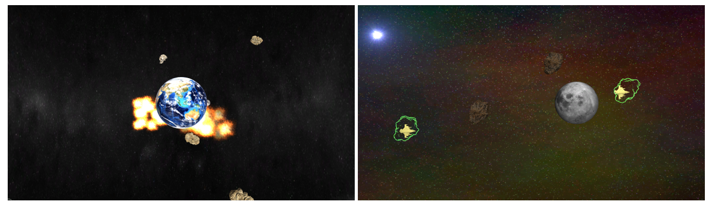
Figure 2. In the first level (left), meteoroids are flying towards earth from different angles. In the second level (right), enemy space ships are flying from left to right hiding behind meteoroids on a different depth layer.