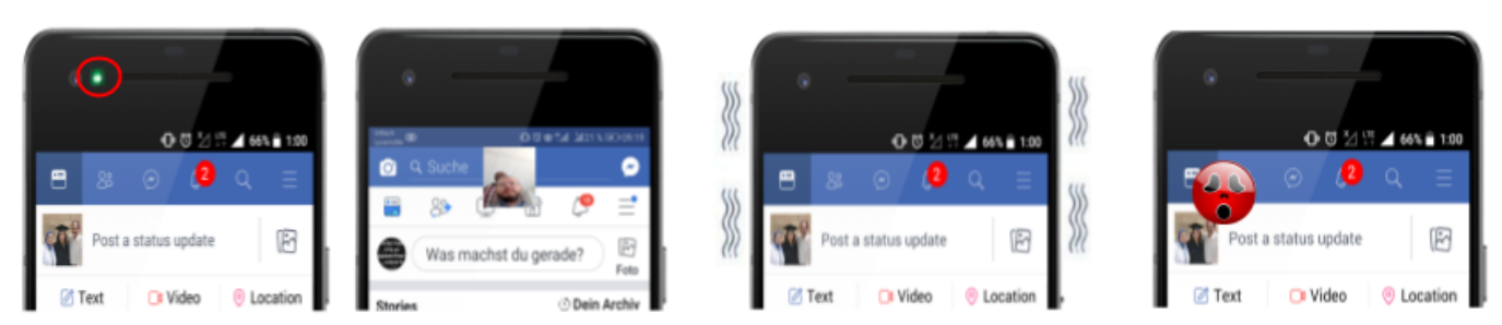
Figure 3. DSSytem interface in case of shoulder surfing: LED flash light is on(Left), a preview of the front camera appears (second to left), vibration(second to right) and icon overlay (right)

Next, we focused on details of the shoulder surfing attack that should be communicated in addition to the fact of being shoulder surfed in general. Participants mentioned the direction and distance of the attacker plays an important role. Further, the amount of time of being shoulder surfed is important since it can differentiate a brief peek from a more privacy invading reading of content.